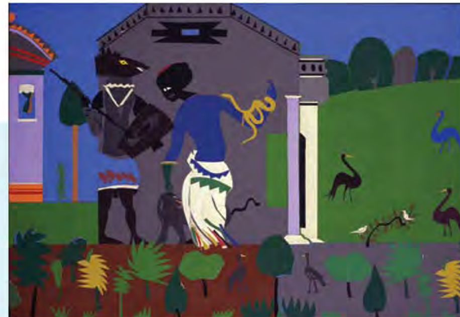
ABOVE Circe Turns a Companion of Odysseus into a Swine , DC Moore Gallery and the Romare Bearden Estate and Foundation LEFT The Fall of Troy , Private Collection