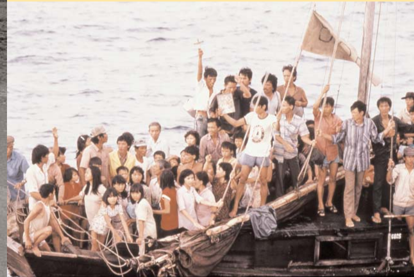
BOAT PEOPLE SOS, INC.

Exit Saigon includes compelling images of the fall of Saigon, the exodus of the “boat people,” and temporary refugee camps in the United States. Colorful contemporary photographs record the Vietnamese Americans honoring their own cultural heritage while embracing uniquely American traditions.