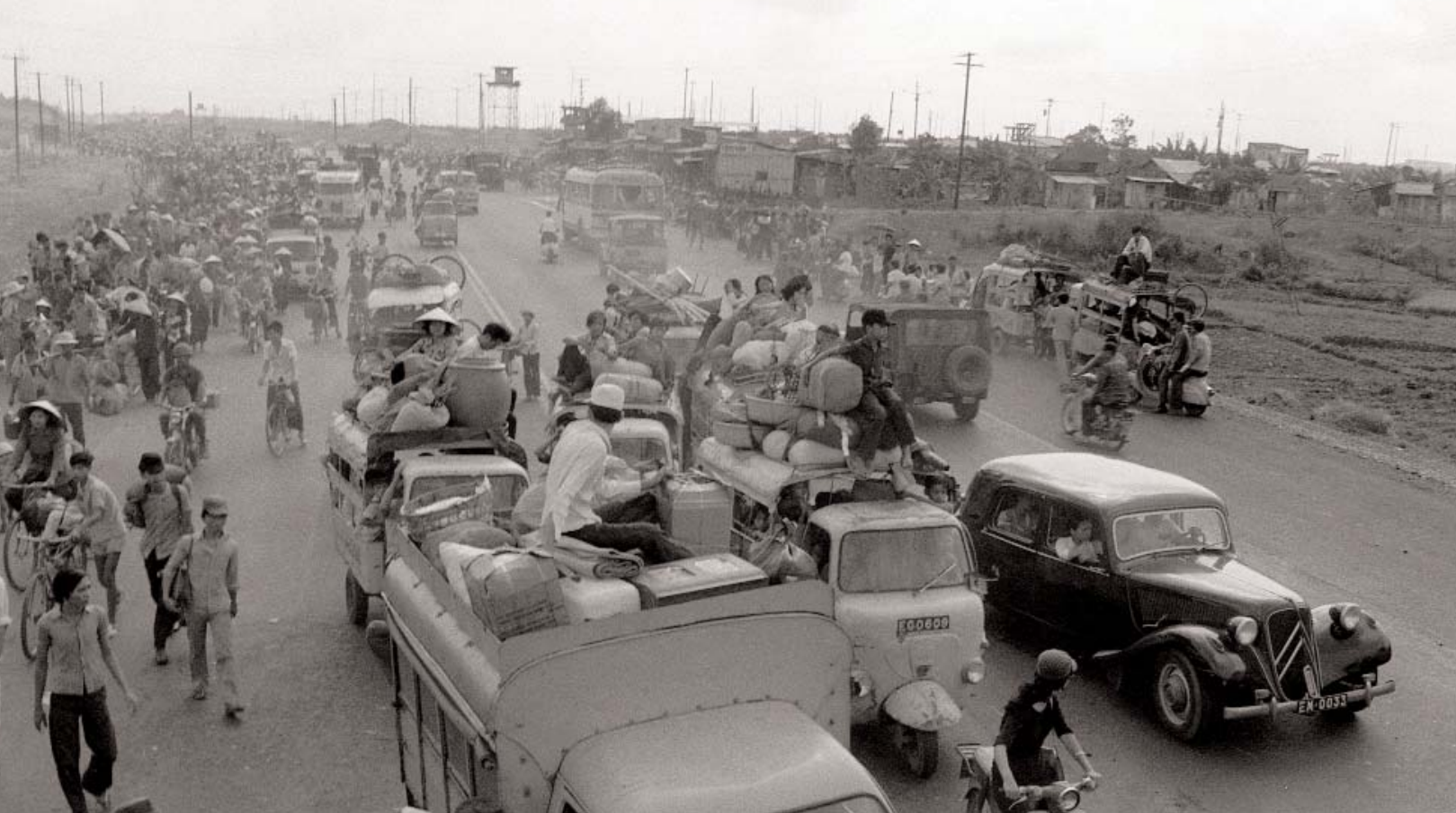
FLEEING SAIGON, 1975

Exit Saigon includes compelling images of the fall of Saigon, the exodus of the “boat people,” and temporary refugee camps in the United States. Colorful contemporary photographs record the Vietnamese Americans honoring their own cultural heritage while embracing uniquely American traditions.