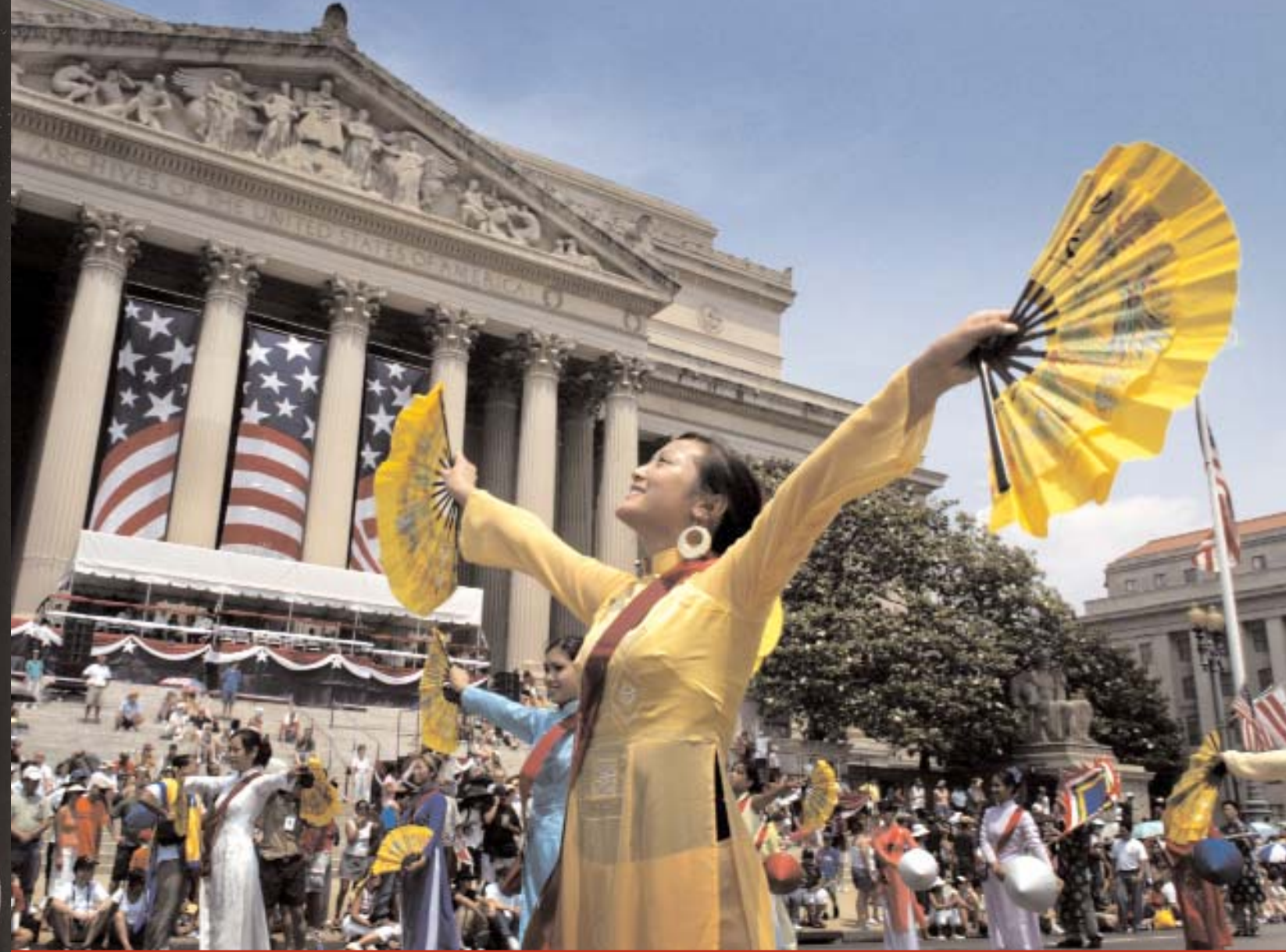
Cover: Fourth of July parade in Washington, D.C.